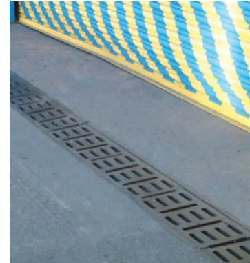
Linear drainage gratings, Birmingham.

Unlike less flexible suppliers, we can also deliver on-site, at weekends or outside normal working hours to suit any given phase of a construction project.