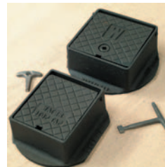
Decorative architectural castings.