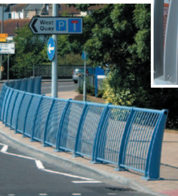
Railing stanchions, Liverpool.