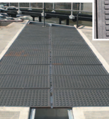
Lock cover plates, Bristol.

Our envirofacturing initiative underpins our approach and ensures that environmentally friendly practices are employed throughout the organisation.