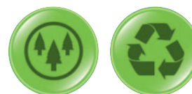
Printed on recycled paper