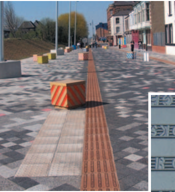
Decorative floor plates, Middlesborough.